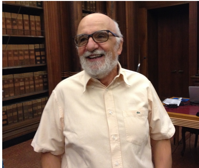
Homage to an influential figure of Italian and international psychology.