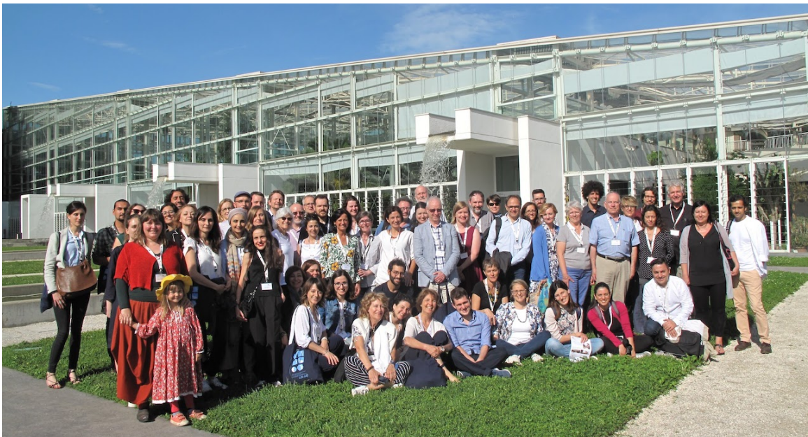
The EWIC participants in front of the Museum of the Botanic Garden.