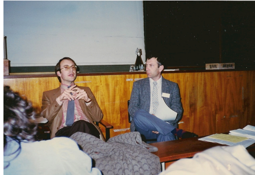
A session of the Swansea conference.