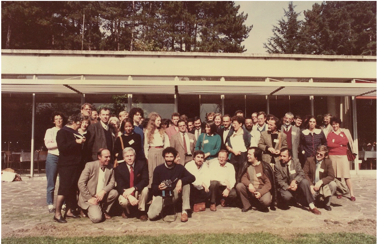
Group photo of the first EWIC on the Orsay campus.

The proceedings of the workshop were published as a book in the NATO ASI Series.