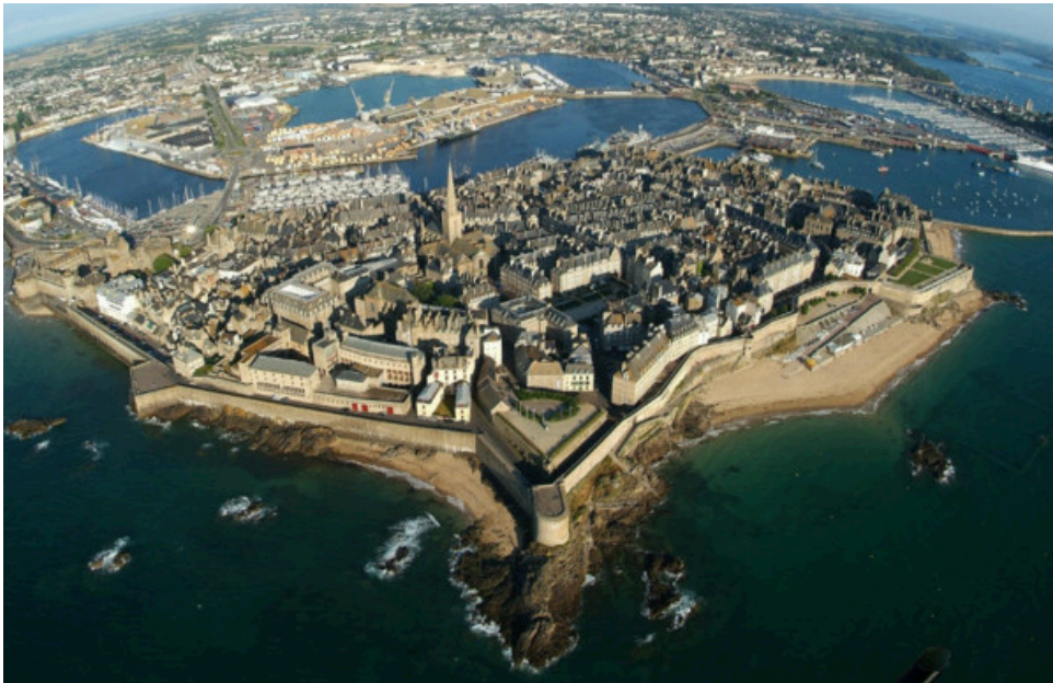
The old city of Saint-Malo...

EWIC returned to France for the first year of the new millennium. The scenic environment of the city of Saint-Malo, in Brittany, surrounded by its medieval granite walls created an inspiring context for the meeting.