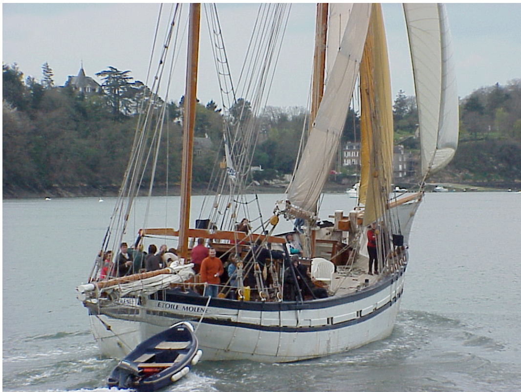
A satellite symposium... A crew of high visuo-spatial imagers boarding the ketch "Etoile Molène" for a special cruise on the Rance river.