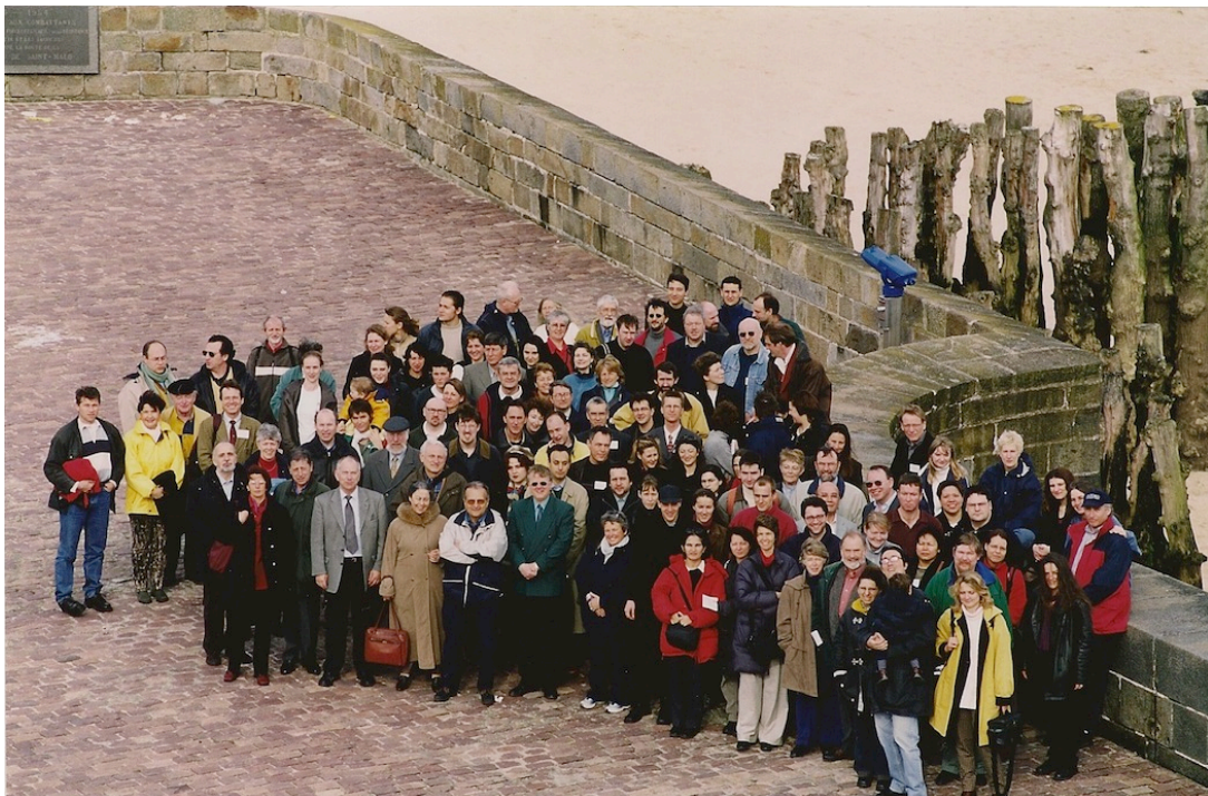
The EWIC family on the Saint-Malo ramparts.

http://www.micheldenis.fr/wp-content/uploads/2013/07/2004-Neuroimaging-of-mental-imagery-txt.pdf