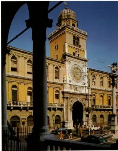
Torre dell'Orologio, Piazza dei Signori, Padua.