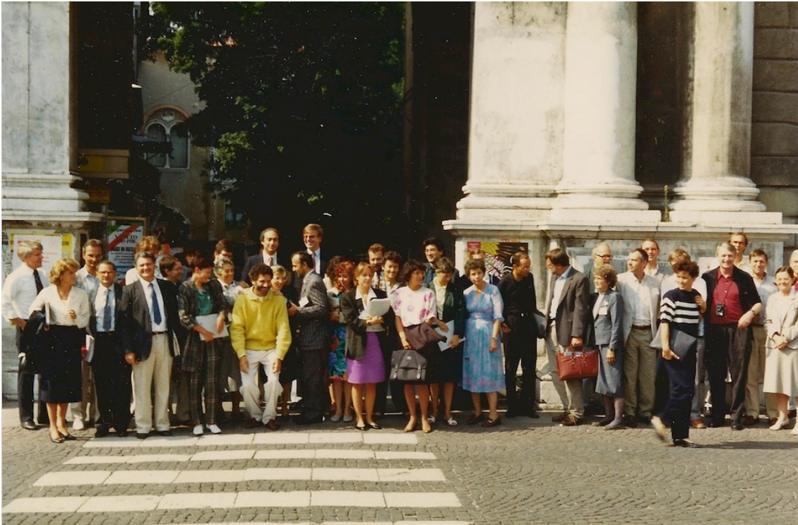
Group photo of the Second Workshop on Imagery and Cognition (SWIC) in Padua.