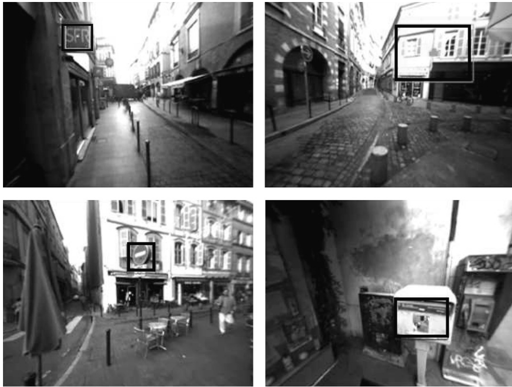
Fig. 2. Examples of geolocated visual landmarks (visual reference points) used for user-positioning. The rectangles indicate target detection in the camera view. Up left: shop sign, up right: facade, down left: road sign, and down right: mailbox.