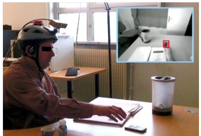
Fig. 1. Picture of a user with the NAVIG prototype. The camera view is shown in inset in the right corner. The user interacts with the system via voice recognition; in this case, he would like to grab his phone, the system then activates the search of the corresponding models. The phone is detected in the camera view (rectangle in the inset). A dynamic virtual sound indicating the object position is provided to the user.

The absence of pedestrian features in databases represents a major challenge to the effectiveness of Geographical Information System (GIS) based personal guidance system [21]. It is obvious that the presence of walking pathways (e.g. sidewalks