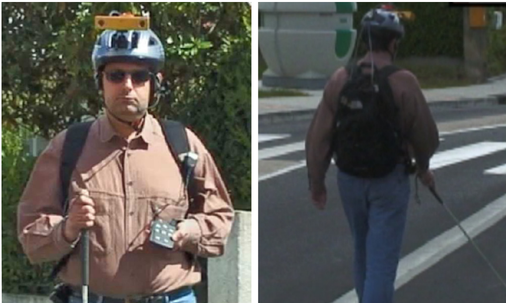
Fig. 4. Left: the NAVIG Prototype including stereoscopic cameras, GPS, sensors, microphone, headphones, and a computer in a backpack. Right: blind user with the NAVIG prototype during a preliminary test.